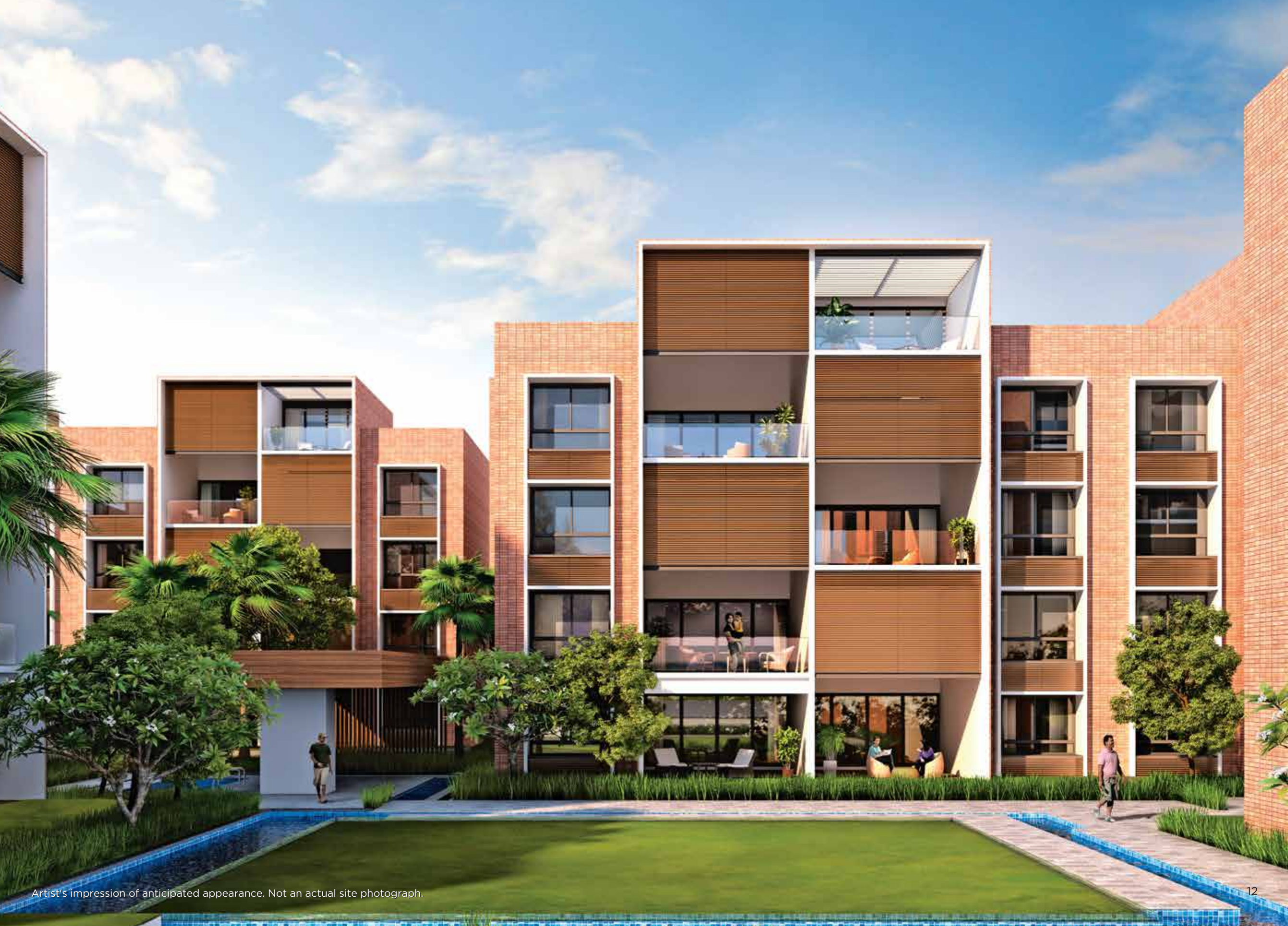
Artist's impression of anticipated appearance. Not an actual site photograph.