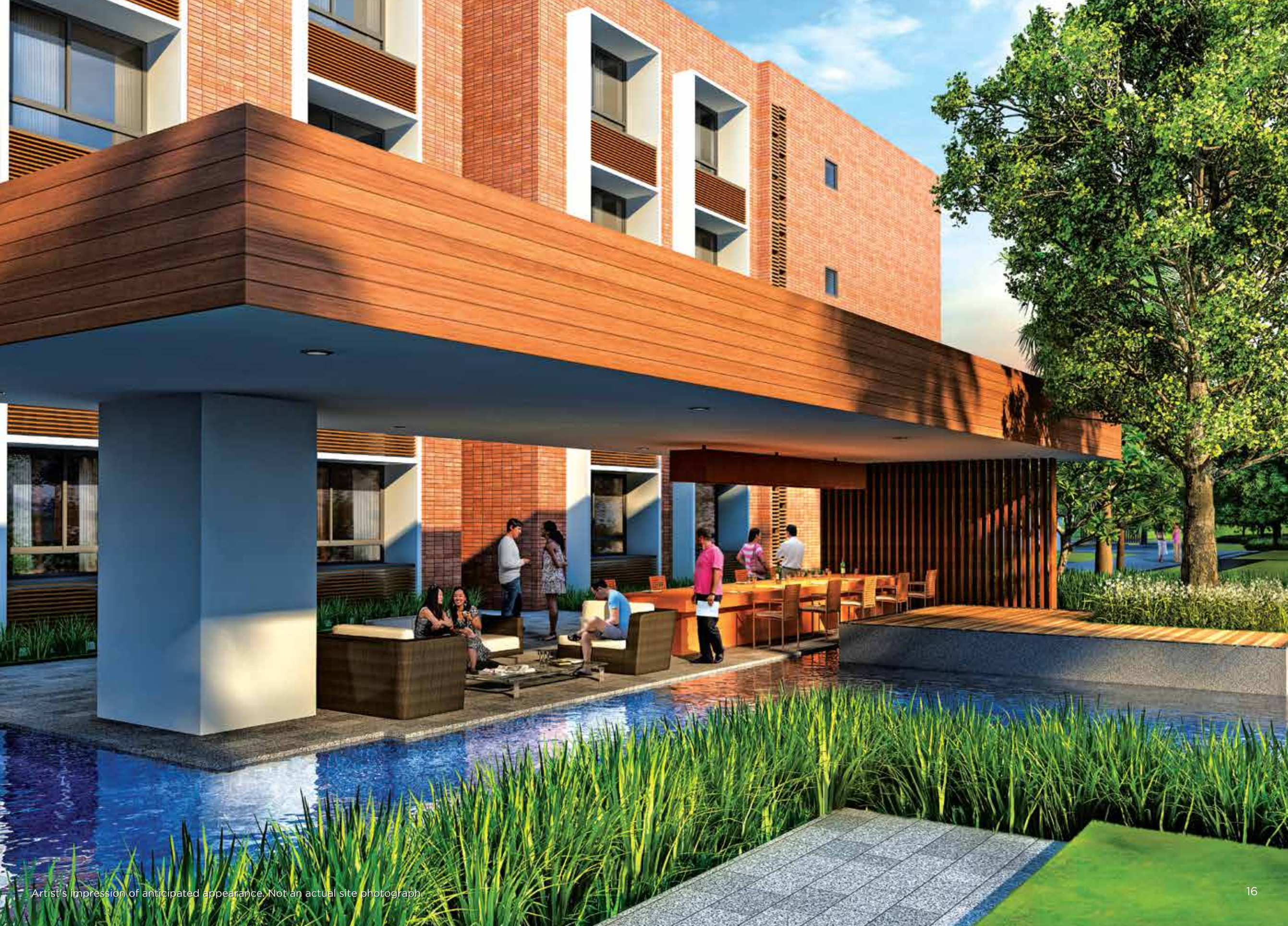
Artist's impression of anticipated appearance. Not an actual site photograph.