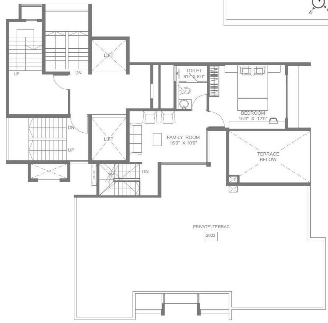
PENTHOUSE FLOOR PLAN - 20TH FLOOR.